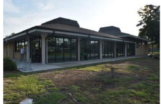
Jeff Maxwell Branch Library 1927 Lumpkin Road Augusta, GA 30906 (706) 793-2020