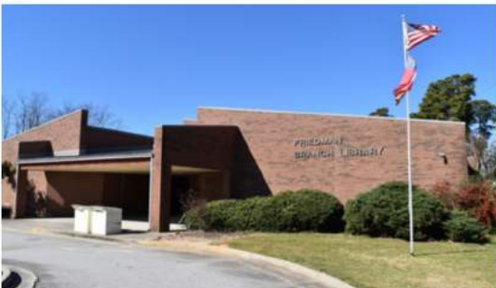
Friedman Branch Library 1447 Jackson Road Augusta, GA 30909 (706) 736-6758