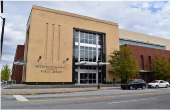
Augusta Public Library - Headquarters 823 Telfair Street Augusta, Ga, 30901 (706) 821-2600