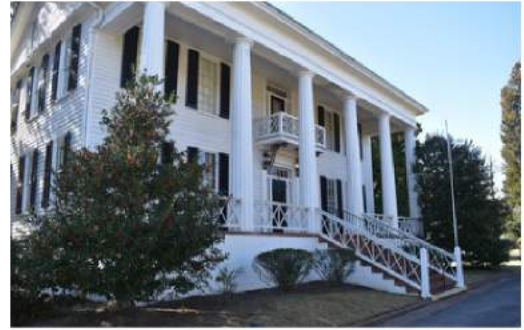
Appleby Branch Library 2260 Walton Way Augusta, GA 30904 (706) 736-6244