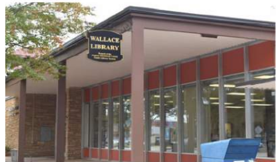
Wallace Branch Library 1237 Laney Walker Boulevard Augusta, GA 30901 (706) 722-6275