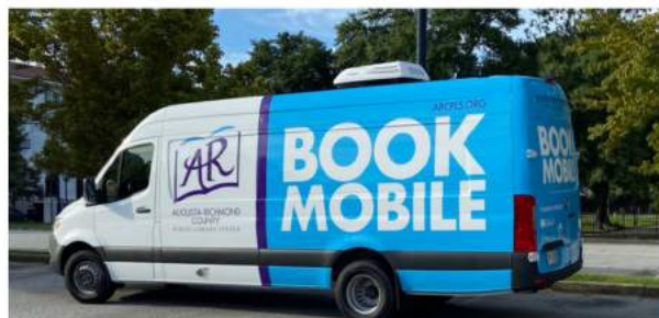
Headquarters Library 823 Telfair Street Augusta, GA 30901 (706) 821-2612